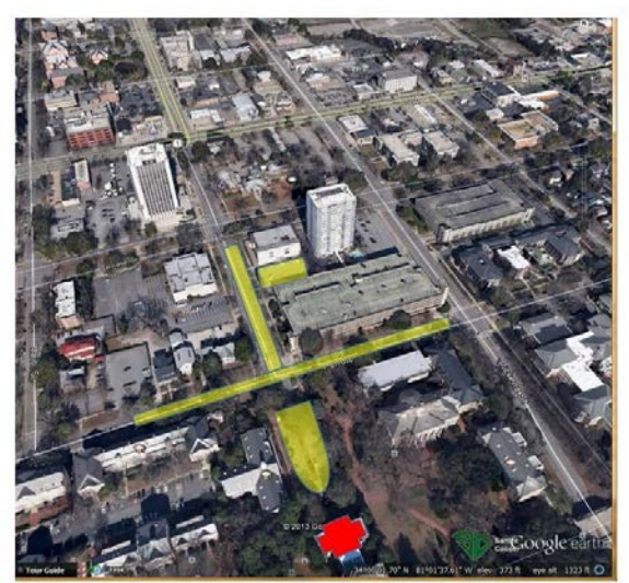
Yellow shaded areas =suggested parking