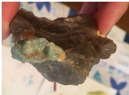
Aquamarine in smoky quartz matrix, found July 2017.

CONTACT: Marf Shopmyer at (864) 910-5369