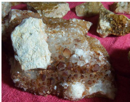
Quartz cluster with iron stain.