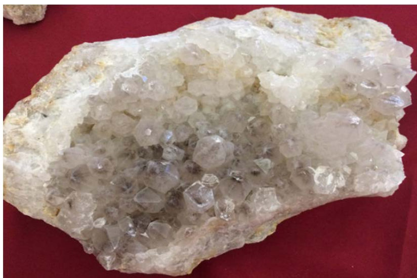
Quartz cluster, approx. 8" across, found Sept. 2017