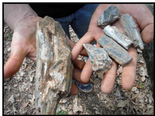
Kyanite cobble and blades