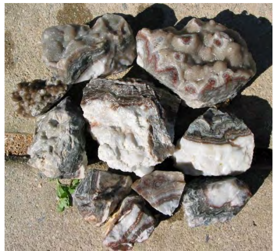
Lace banded chert/agate

IMPORTANT: DMC field trips are open only to members of clubs within the SFMS that have provided their members with field trip liability insurance. SFMS club members are bound by the AFMS code of ethics.