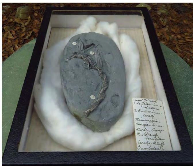
Small Crinoid 1. Leptaerium reductum 2. Leptaerium corymbosum Mississippian Burgess Series Borden Group McClurg Formation Corymbosum Crem. level

The Max Smith fossil collection was donated to the Columbia and Aiken Clubs. The specimens have been sorted and partially identified. The collection has a wide variety of fossils ranging from whale bones from Aurora to bivalves and gastropods from Texas to crinoid and horn coral fossils from Kentucky and Indiana. There are also Pleistocene mammal bones, Geotized Mississippian fossils and other odds and ends. The fossilized geodes are silica pseudomorphs of an anhydrite pseudomorph of a crinoid or horn coral. The initial replacement of the fossil by anhydrite often “explodes” the shape of the fossil to an object that is barely recognizable because of the increased volume of the replacing anhydrite. There are literally hundreds of pounds of Geotized fossils in the donation. Come to the March meeting to see some of the material and have an opportunity to take some home with you from the silent auction. Bring cash and/or your check book. The proceeds from the auction will go to CGMS.