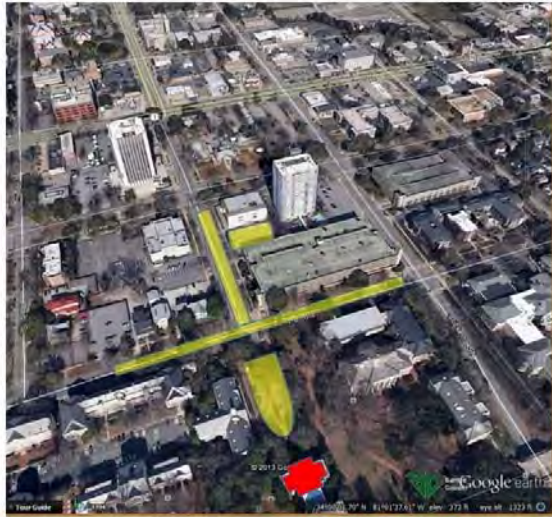
Yellow shaded areas =suggested parking McKissick Museum (in Red)