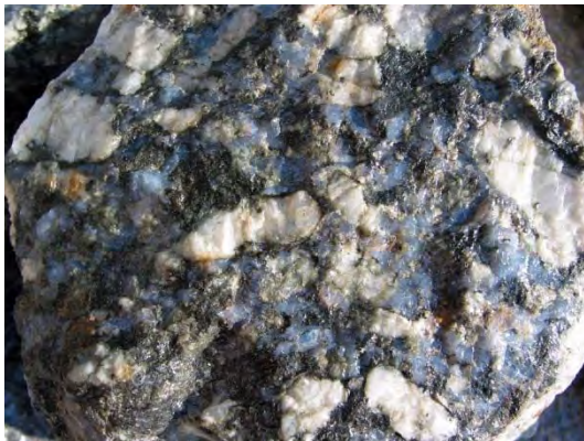
Granite Gneiss with blue quartz

CONTACT: Charles Carter, 770-998-1127, fieldtrips@gaminal.org