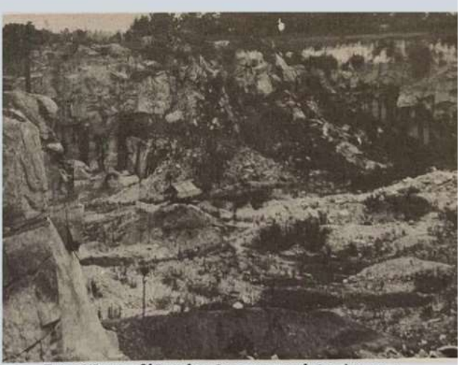
From Weston & Brooker Company 50th Anniversary Brochure-1962

Ever wondered about the Cayce Quarry? The Cayce Quarry, once owned by the Weston and Brooker Company, is a granite quarry that has been active in the area since 1893. It provided materials to build up the Locks system and paved roads in the Cayce-West Columbia area. The quarry is now operated by Martin Marietta.