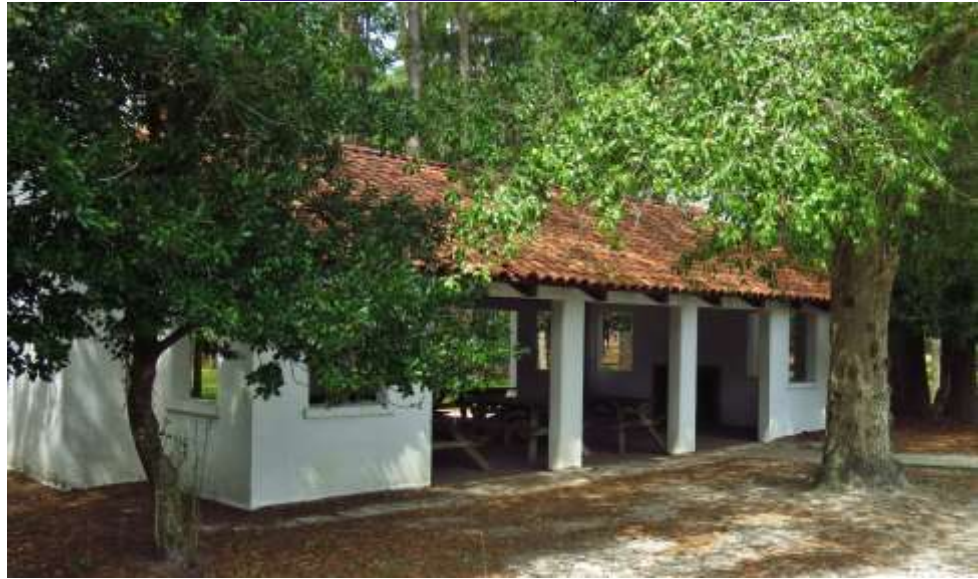
Picnic Shelter No 1 at Sesquicentennial Park

Come join us at the club picnic which will be held at Sesquicentennial State Park at Picnic Shelter No. 1 on Sunday May 1 st 11:00 to 3:00 . Because of COVID-19 we will ask that each member who comes to the picnic abide by CDC guidelines for social distancing. We want this event to be safe for everyone. While at the park, there are opportunities for outdoor recreation such as walking trails, hiking, and bird observation, kayaking and fishing if you would like to extend your day and take advantage of the park. More details to come.