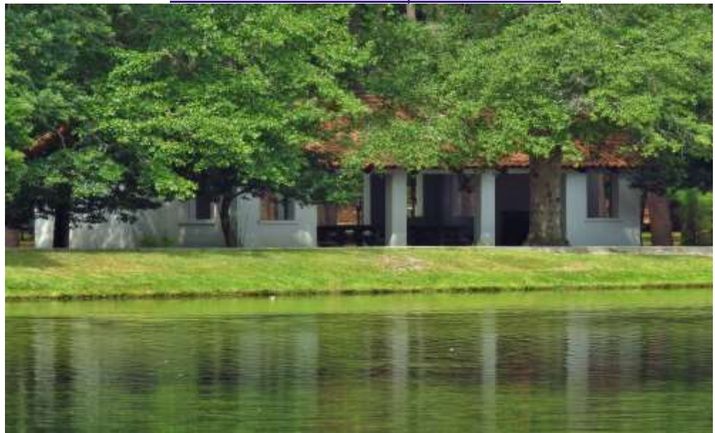
Picnic Shelter No 1 at Sesquicentennial Park

Come join us at the Halloween club picnic which will be held at Sesquicentennial State Park at Picnic Shelter No. 1 (location shown below) on Sunday October 30 th 1:00 to 5:00 . The club will provide charcoal for the grill, some drinks, and ice. Bring your own meat/vegetables to grill and/or your own food. If you want to share any food, package it in individual servings. The activity for the picnic will be a game of stump the experts whereby a panel will be appointed to identify items collected by members. Please bring one or two items that you would like identified (be nice). Ron & Angela will be providing door prizes for the event. Because of COVID-19 we ask that each member who comes to the picnic abide by CDC guidelines for social distancing. We want this event to be safe for everyone. While at the park, there are opportunities for outdoor recreation such as walking trails, hiking, and bird observation, kayaking and fishing if you would like to extend your day and take advantage of the park. For those who need to unload a large amount or have difficulty walking, you can drive to the shelter to unload but cannot park there.