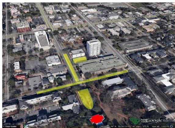
Yellow shaded areas =suggested parking McKissick Museum (in Red)