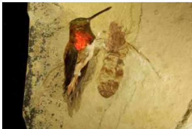
The fossil extinct giant ant Titanomyrma from Wyoming, at the Denver Museum. The fossil queen ant is next to a hummingbird, showing the huge size of this titanic insect.

To read the entire article go to: 'Giant' ant fossil raises questions about ancient Arctic migrations (phys.org)