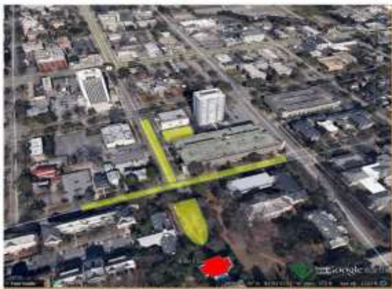
Yellow shaded areas =suggested parking McKissick Museum (in Red)