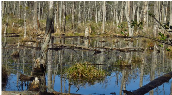
Beaver Pond in Gills Creek Watershed at Sesquicentennial State Park.